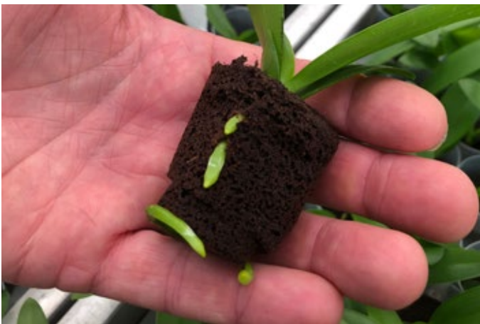
Plant 8 weeks after transplanting.

At the beginning of week 28 of 2023, we started transplanting in Quick Plug. The start goes better than before and ensures that we make a plant that is healthier, stronger and more uniform, especially after sorting!