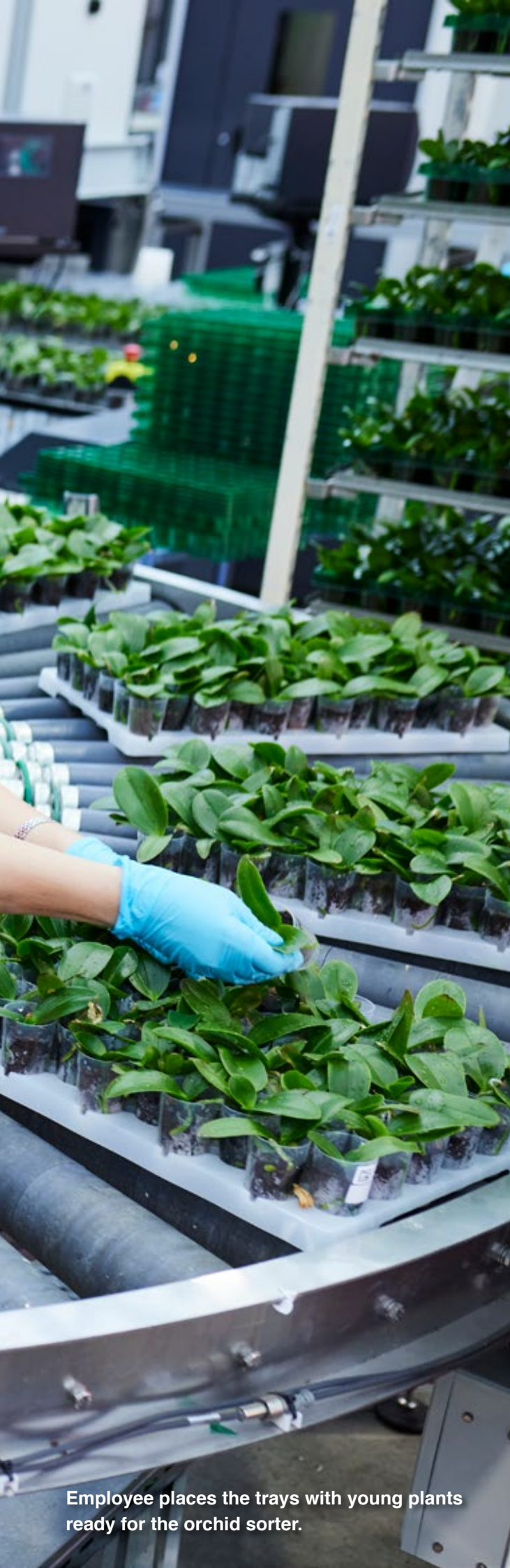
Employee places the trays with young plants ready for the orchid sorter.

These machines have enhanced our sorting quality considerably, and led to big improvements in fulfilling Phalaenopsis orders with plants of the correct uniformity, quality, and age. From week 50, the entire production of young plants will be delivered sorted in plug in Heemskerk, and also shipped in the Quick Plug.