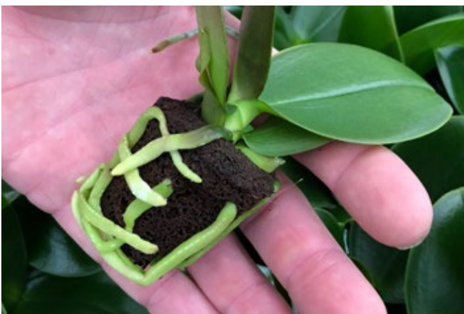
Plant 20 weeks after transplanting.

We tested the Quick Plug for more than 8 months and saw positive signs right from the very beginning. Now, after many thorough checks and inspections, we can conclude that the Quick Plug gives good results. Within a few weeks of transplanting, the young plant is already extremely well rooted with a larger volume and the roots develop more and faster. You can expect the first deliveries of young plants in a Quick Plug around the turn of the year.